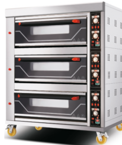
GBO-36 Bakery Gas 3 Deck 6 Tray Oven Dimension: 1300x840x1720mm Chamber: 870x650x230mm Tray Size: 400x600x30mm Power: 0.30 Kw