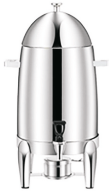
TU-19 Coffee/Tea Urn Size: 345x345x600mm Cap.: 19 Ltrs.