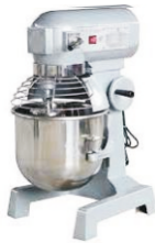
B-10 Bakery Food Planetary Mixer Cap.: 10 Ltrs. Power: 500 W Max Kneading: 1.5 Kgs.