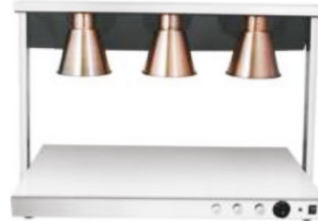
Triple Lamp Warmer (with base heater) Size: 1070x500x700mm Power: 1400w