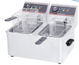
TEF-82 Commercial Deep Fryer Double Tank Size: 480x410x345mm Power: 3.25 Kw+3.25 Kw Cap.: 8+8 Ltrs.

MICRO SWITCH, OVER TEMP LIMITER & HANDLE