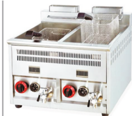
Double Gas Fryer, 72A Size: 616x660x550mm Cap.: 16x2Ltrs.