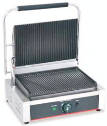
TCG-811E Commercial Single Plate Electric Contact Grill Size: 425x370x190mm Power: 2.2 Kw