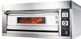
EDO-11 Bakery Electric 1 Deck 1 Tray Oven Size: 945x605x485mm Stone Size: 638x430mm Power: 3.2 Kw