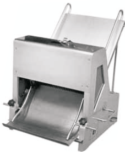
WG-Q31A Bread Slicer Size: 730x680x900mm Power: 250w Thickness of Slice: 12mm No. of Slice: 31