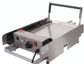
Bun Toaster Size: 406x660x290mm Power: 2.4Kw