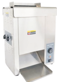
Vertical Bun Toaster Size: 425x295x615mm Voltage: 220v