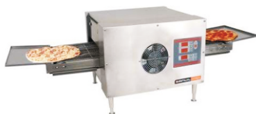
18 Gas Conveyor Pizza Oven Chain Size: 530x1470mm Temperature: 0~400 C Gas Type: LPG/LNG Dimension: 1570X800X380mm Power: 220 V ~ 100 W