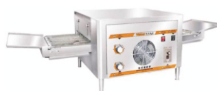
12 Electric Conveyor Pizza Oven Chain Size: 380x1000mm Temperature: 0~400 C Dimension: 1100x620x370mm Power: 220 V~6.7 Kw