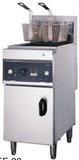
TEF-28 Standing Electric Fryer 28L Size: 420x830x1110mm Cap.: 28 Ltrs Power: 10 Kw