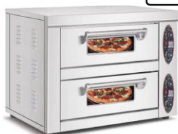
EBO-22 Bakery Electric 2 Deck 2 Tray Oven Size: 930x630x700mm Stone Size: 483x635mm X 2 Power: 6.4 Kw