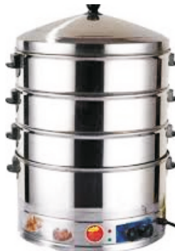
Electric Momo Steamer Size: 40,47,52 cm Power: 3500 w