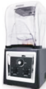
Sound Proof Bar Blender Cap.: 2 Ltrs. Power: 1800 W