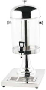
JD-8 Juice Dispenser Size: 260x345x575mm Cap.: 8 Ltrs.