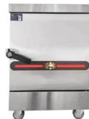
Rice Cooking Machine 4 Tray Dia: 700x600x810mm Power: 6 Kw