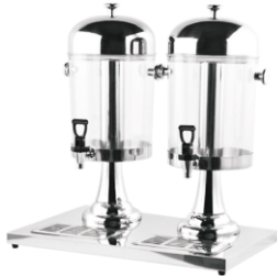
JD-16 Juice Dispenser Size: 560x345x575mm Cap.: 16 Ltrs.