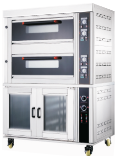
40D+10F Bakery Electric 2 Deck 4 Tray Oven With Proofer Dimension: 1300x840x1900mm Chamber: 860x660x200mm Tray Size: 400x600x30mm Power: 15.2 Kw