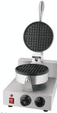
TRW-1 Commercial Round Waffle Maker Size: 250x350x260mm Power: 1 Kw