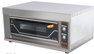
EBO-12 Bakery Electric 1 Deck 2 Tray Oven Dimension: 1235x800x500mm Chamber: 860x660x200mm Power: 6.6 Kw