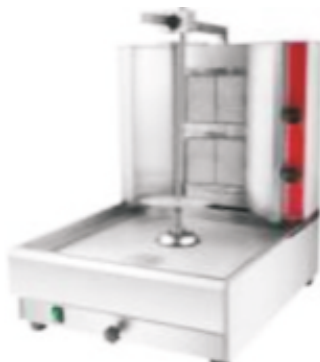
Gas Shawarma Machine PG-2 Size: 535x885x750mm