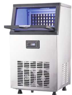
Ice Cube Machine Cap.: 35 Kg/ 24Hr, 55 Kg./24 Hr