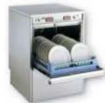
Under counter dish washer