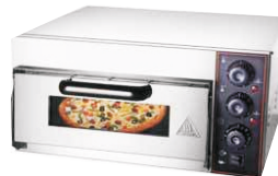
ZH-1M Single Deck Pizza Oven Size: 650x570x280mm Stone Size: 400x400mm Power: 2 Kw