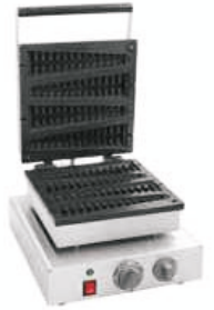
Lolly Waffle Maker Size: 450x350x280mm Power: 1.75 Kw