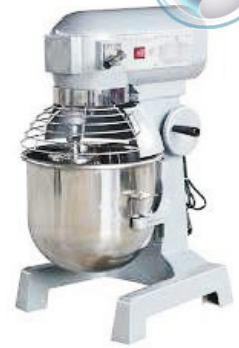
B-40 Bakery Food Planetary Mixer Cap.: 40 Ltrs. Power: 2 Kw Max Kneading: 12 Kgs.