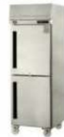
2 Doors Vertical Freezer