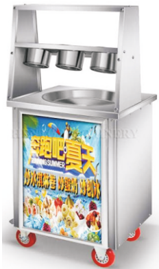
Fried Ice Cream Machine Pot Dia: 350mm Size: 500x485x700+400mm Power: 950 W