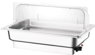
Electric SS Chafer (Roll Top Cover) Capacity: 10 Ltr.