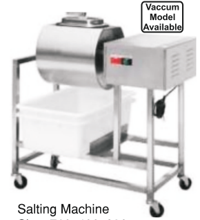
Salting Machine Size: 710x400x830mm Cap.: 35 Ltrs. Power: 350 W