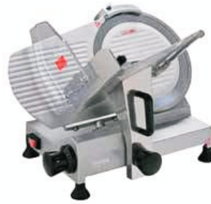
Meat Slicer (250mm) Size: 575x465x415mm Power: 150 W Thickness: 0.2~12mm, Wider: 180mm