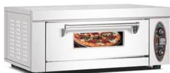
EBO-11 Bakery Electric 1 Deck 1 Tray Oven Size: 930x630x400mm Stone Size: 483x635mm Power: 3.2 Kw