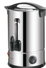
WB-20 Water Boiler Cap.: 20 Ltr.