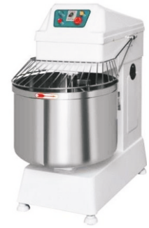
SM-60 Spiral Mixer Cap.: 64 Ltrs. Power: 2.6 Kw Max Kneading: 26 Kgs.