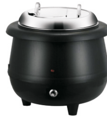
SMP-13 Soup Warmer Size: 385x385x410mm Cap.: 13 Ltr.