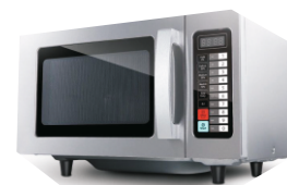
Commercial Microwave Oven Output Power: 1000 W Membrane Touch Control Cap.: 25 Ltrs.