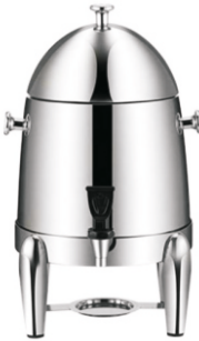
TU-12 Coffee/Tea Urn Size: 280x350x500mm Cap.: 12 Ltrs.