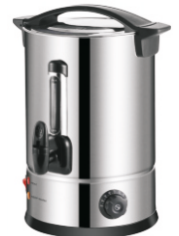
WB-30 Water Boiler Cap.: 30 Ltr.