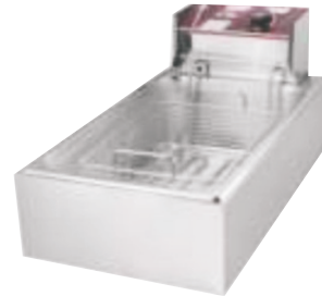
1/1 Single Fryer Size: 660x340x160mm Power: 3 Kw Cap.: 12 Ltrs.