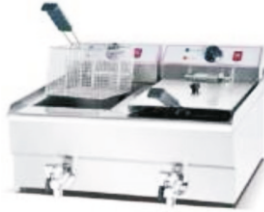
Double Fryer Size: 570x470x350mm Power: 3 Kw X 2 Cap.: 10 Ltrs. X 2