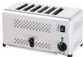
6 Slice Toaster Size: 460x210x225mm Power: 3.3 Kw