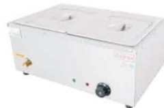
2 Pans Electric Bain Marie Size: 570x370x280mm Power: 1.2 Kw