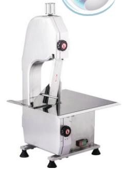
Bone Saw Machine Size: 490x500x880mm Power: 1500 W Saw Blade Size: 1650mm