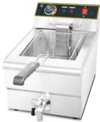
TEF-101V Commercial Deep Fryer Single Tank Size: 280x470x350mm Power: 3 Kw Cap.: 10 Ltrs.