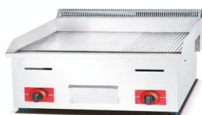
Gas Griddle 722 Size: 730x565x540mm