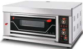
GBO-11 Bakery Gas 1 Deck 1 Tray Oven Dimension: 960x600x500mm Chamber: 650x420x220mm Tray Size: 400x600x30mm Power: 0.10 Kw