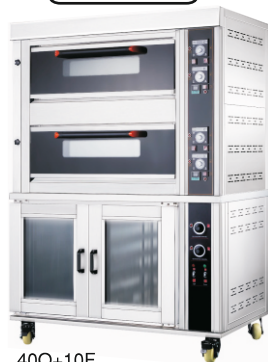
40Q+10F Bakery Gas 2 Deck 4 Tray Oven With Proofer Dimension: 1300x840x1900mm Chamber: 860x660x200mm Tray Size: 400x600x30mm Power: 3.2 Kw