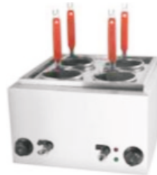
Pasta Boiler 4 Compartment Size: 180x180x130mm Power: 4kw