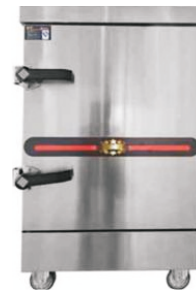
Rice Cooking Machine 8 Tray Dia: 720x640x1170mm Power: 9 Kw