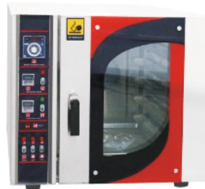
Commercial Gas Convection Oven (5 Tray) Dimension: 900x1375x780mm Power: 0.65 Kw Voltage: 220 v