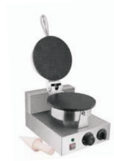
TCB-1 Commercial Cone Waffle Maker Size: 280x380x230mm Power: 1 Kw