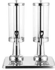
JD-6 Juice Dispenser Size: 400x290x500mm Cap.: 6 Ltrs.