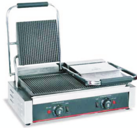
TCG-813E Commercial Double Plate Electric Contact Grill Size: 565x370x190mm Power: 2.2 Kw x 2