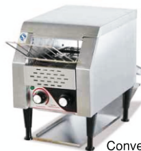
Conveyor Toaster TT-150 Size: 290x420x390mm Power: 1.32 Kw