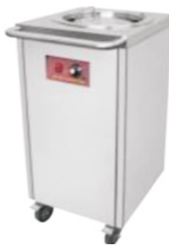
Single Plate Warmer, 50 Plates Size: 460x560x950mm Power: 400W