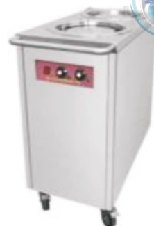
Double Plate Warmer, 100 Plates Size: 500x900x950mm Power: 800W