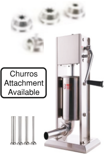
Sausage Stuffer, SV-5 Size: 300x235x650mm Cap.: 5 Ltrs.