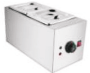
Chocolate Stove, 2 Pan Size: 205x400x225mm Power: 1kw