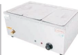
3 Pans Electric Bain Marie Size: 575x365x265mm Power: 1.5 Kw