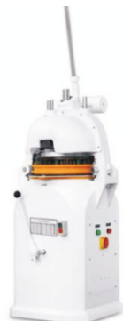
Dough Rounder Divider Size: 640x540x2100mm Power: 750W Dough Weight: 30~100gm