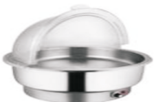
Electric SS Chafer (Roll Top Cover) Capacity: 7 Ltr.