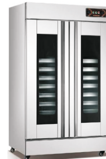
WG-26C Electric Proofer 26 Tray Size: 1000x700x1610mm Power: 2.8Kw Temp Range: 30~60 C