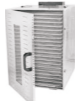
Electric Food Dehydrator 20 Tray Size: 430x535x794mm Power: 1600 w