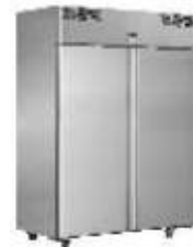
Double Door Refrigerator