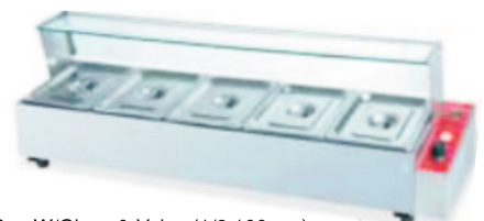
5 Pan W/Glass & Valve (1/2 100mm) Size: 1450x350x360mm Power: 1.8 Kw