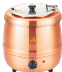
SWS-10 (Rose Gold) Soup Warmer Size: 350x350x360mm Cap.: 10 Ltr.