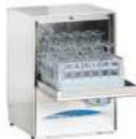
Under counter glass washer