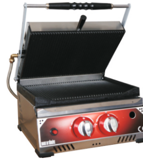
DD-7700 Gas Sandwich Griller Size: 440x440x270mm Plate Size: 400x300mm Pressure: 30 mbar