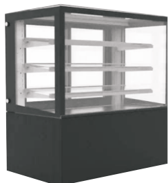
Cake Showcase Size: 1200x620x1300mm Power: 720w TEMP.: 4~8 C