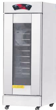
WG-13C Electric Proofer 13 Tray Size: 500x690x1500mm Power: 2.6Kw Temp Range: 30~60 C