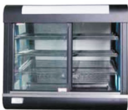
Premium Food Warmer Size: 660x480x610mm Power: 1.5 Kw