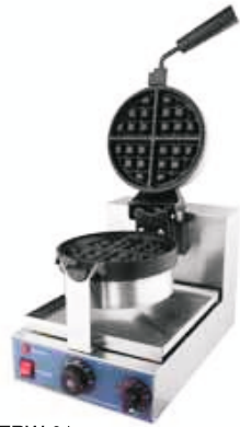
TRW-01 Commercial Round Rotary Waffle Size: 490x250x350mm Power: 1.3 Kw