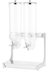
CD-8 Cereal Dispenser Size: 340x240x640mm Cap.: 8 Ltrs.