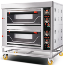
GBO-24 Bakery Gas 2 Deck 4 Tray Oven Dimension: 1300x890x1410mm Chamber: 870x650x230mm Tray Size: 400x600x30mm Power: 0.20 Kw