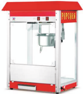
TPM-8R Commercial Electric Pop Corn Machine Size: 560x420x760mm Power: 1.5 Kw