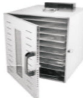
Electric Food Dehydrator 10 Tray Size: 460x400x500mm Power: 1000 w