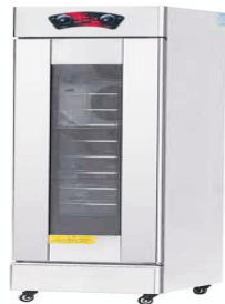
WG-6C Electric Proofer 6 Tray Size: 500x690x750mm Power: 2Kw Temp Range: 30~60 C