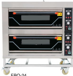
EBO-24 Bakery Electric 2 Deck 4 Tray Oven Dimension: 1235x800x1010mm Chamber: 860x660x200mm Power: 13.2 Kw