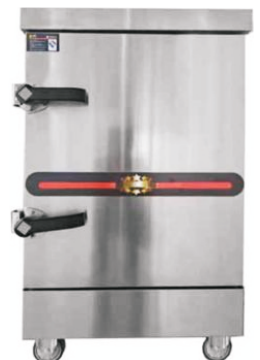
Rice Cooking Machine 12 Tray Dia: 720x640x1550mm Power: 12 Kw