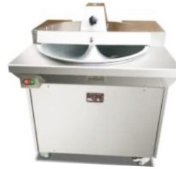
QXP 30 Bowl Chopper Power: 550w Size: 770x710x960mm Cap.: 20 Ltrs.