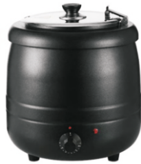
SWM-10 Soup Warmer Size: 350x350x360mm Cap.: 10 Ltr.