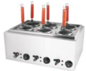
Pasta Boiler 6 Compartment Size: 210x190x130mm Power: 6kw