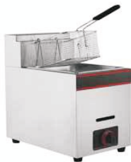
TGT-71 Commercial Deep Fryer Single Tank Size: 290x520x480mm Cap.: 6 Ltrs.