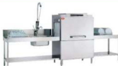
Conveyor Type Dishwasher