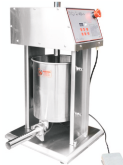
Sausage Stuffer (Electric), SV-10 Size: 420x310x660mm Cap.: 10 Ltrs.