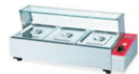
3 Pan W/Glass & Valve (1/2 100mm) Size: 940x350x360mm Power: 1.5 Kw