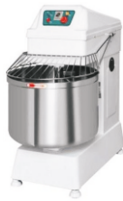
SM-20 Spiral Mixer Cap.: 22 Ltrs. Power: 1.1 Kw Max Kneading: 8 Kgs.