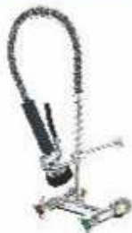
Pre-Rinse Unit image