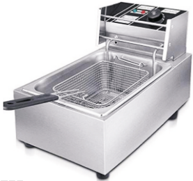
TEF-61 Commercial Deep Fryer Single Tank Size: 290x460x310mm Power: 2.5 Kw Cap.: 5.5 Ltrs.