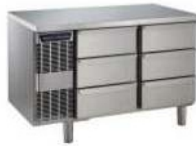
Drawer Undercounter Refrigerator