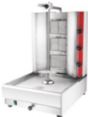
Gas Shawarma Machine PG-3 Size: 535x885x980mm