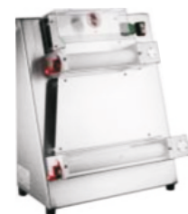
Pizza Sheeter, T 40 Size: 370x656x715mm Power: 390w Short Roller: 025x045x300 Long Roller: 048x025x422