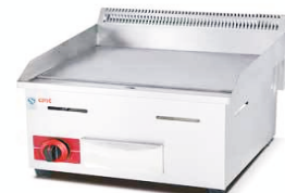
Gas Griddle 718 Size: 550x514x540mm