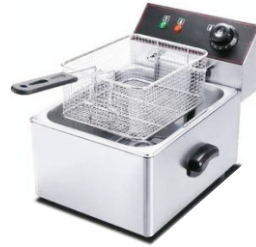
TEF-81 Commercial Deep Fryer Single Tank Size: 265x410x345mm Power: 3.25 Kw Cap.: 8 Ltrs.

MICRO SWITCH, OVER TEMP LIMITER & HANDLE