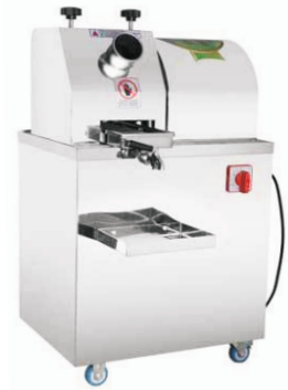
Sugar Cane Juicer Size: 480x390x780mm Power: 1.1 Kw