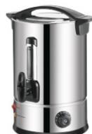
WB-10 Water Boiler Cap.: 10 Ltr.