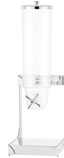
CD-4 Cereal Dispenser Size: 200x440x640mm Cap.: 4 Ltrs.