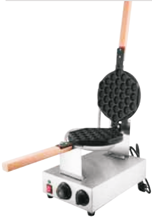
Egg Waffle Maker Size: 225x420x290mm Power: 1.4 Kw