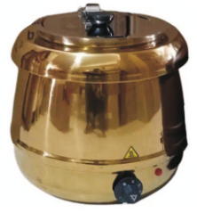
SWS-10 (GOLD) Soup Warmer Size: 350x350x360mm Cap.: 10 Ltr.