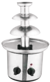
Chocolate Fountain 3 Tier Size: 240x560mm Power: 80 W