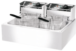
TEF-62 Commercial Deep Fryer Double Tank Size: 580x460x310mm Power: 2.5 Kw+2.5 Kw Cap.: 5.5+5.5 Ltrs.