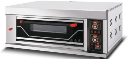
GBO-13 Bakery Gas 1 Deck 3 Tray Oven Dimension: 1770x890x1410mm Chamber: 1300x670x220mm Tray Size: 400x600x30mm Power: 0.20 Kw