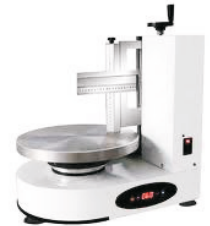
Cake Icing Machine Size: 550x410x580mm Power: 60 W Max Height: 180mm Dia: 40~12mm