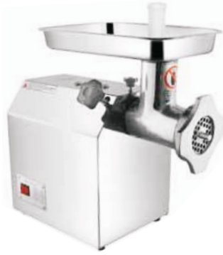
TC-22 Commercial Meat Mincer Power: 1.1 Kw Cap.: 150 Kg/Hr.