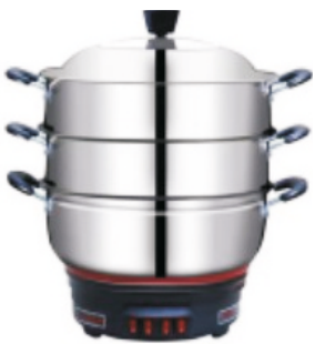
Electric Momo Steamer Size: 34 cm Power: 1500 W