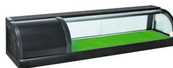
Sushi Counter Size: 1200X350X340MM Temp: 2~8 C