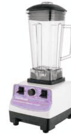
BL-767 Commercial Blender Size: 2 Ltrs. Power: 1500 W