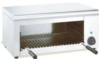
Electric Salamander 936 Size: 610x310x280mm Power: 2 Kw