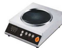
Commercial Induction Wok Size: 420x350x100mm Power: 3500 W