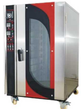
Commercial Gas Convection Oven (10 Tray) Dimension: 900x1375x1470mm Power: 0.65 Kw Voltage: 220 v