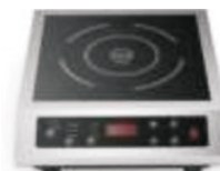
Commercial Induction Size: 320x420x100mm Power: 3500 W