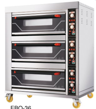
EBO-36 Bakery Electric 3 Deck 6 Tray Oven Dimension: 1200x820x1450mm Chamber: 860x660x220mm Power: 19.6 Kw