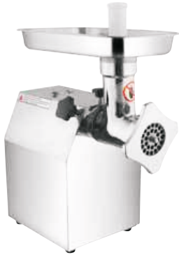
TC-12 Commercial Meat Mincer Power: 850 W Cap.: 120 Kg/Hr.