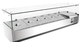
Table Top Cold Bain Marie Size: 1350x335x430mm Temp: 0~10 C (6 Pans)