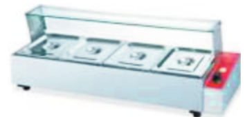
4 Pan W/Glass & Valve (1/2 100mm) Size: 1200x350x360mm Power: 1.5 Kw