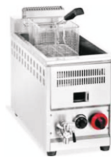
Single Gas Fryer 71A Size: 310x660x550mm Cap.: 16 Ltrs.