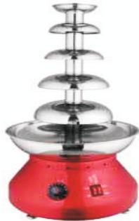
Chocolate Fountain 5 Tier Size: 330x600mm Power: 600 W