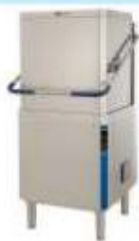
Hood Type Dish Washer