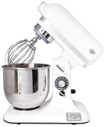
B-7 Bakery Food Planetary Mixer Cap.: 7 Ltrs. Power: 350 W Max Kneading: 0.5 Kgs.