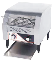
Conveyor Toaster TT-300 Size: 370x420x390mm Power: 1.92 Kw