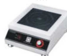
Commercial Induction Size: 510x400x200mm Power: 5000 W