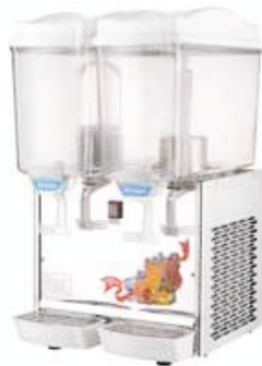
Cold Juice Dispenser Cap.: 18 Ltrs. x 2 Size: 410x450x715mm Power: 300 W