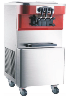
Softy Ice-Cream Machine Size: 770x540x1480mm Power: 220 V