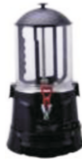
Hot Chocolate Dispenser Power: 400 W Cap.: 5 Ltr.