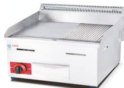
Gas Griddle 718B Size: 550x514x540mm