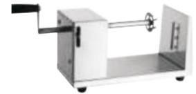
Manual Twister Potato Cutter Size: 330x130x140mm