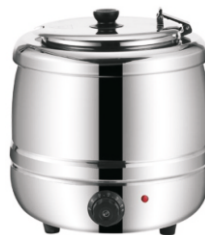
SMSS-10 Soup Warmer Size: 350x350x360mm Cap.: 10 Ltr.