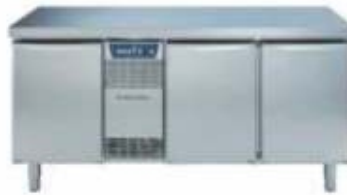
Under counter Refrigerator