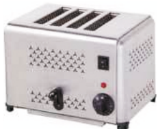
4 Slice Toaster Size: 370x210x225mm Power: 1.28 Kw