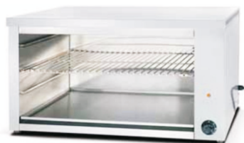
Electric Salamander 938 Size: 580x390x390mm Power: 2.2 Kw