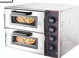
ZH-3M Double Deck Pizza Oven Size: 560x570x440mm Stone Size: 400x400mm Power: 3 Kw