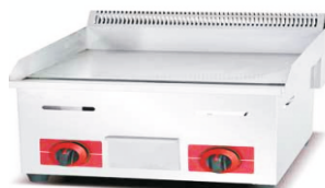
Gas Griddle 720 Size: 730x565x540mm