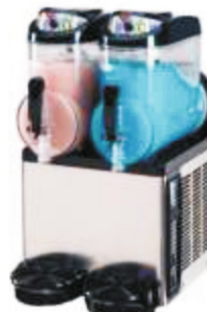
Slush Machine Cap.: 12 Ltrs. X 2 Size: 430x530x800 Mm Power: 890 W