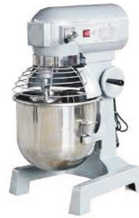
B-30 Bakery Food Planetary Mixer Cap.: 30 Ltrs. Power: 1.5Kw Max Kneading: 5 Kgs.