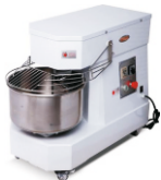
SM-10 Spiral Mixer Cap.: 10 Ltrs. Power: 0.75 Kw Max Kneading: 4 Kgs.