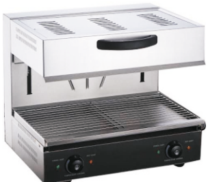
Lift-UP Electric Salamander 450 Size: 500x450x470mm Power: 2.8 Kw