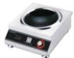
Commercial Induction Wok Size: 510x400x200mm Power: 5000 W