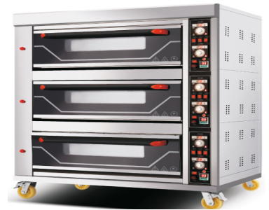
GBO-39 Bakery Gas 3 Deck 9 Tray Oven Dimension: 1770x890x1705mm Chamber: 1300x670x220mm Tray Size: 400x600x30mm Power: 0.30 Kw