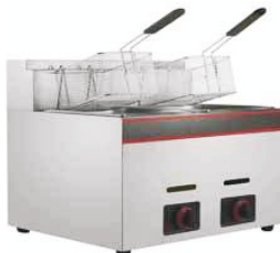
TGT-72 Commercial Deep Fryer Double Tank Size: 570x520x480mm Cap.: 6+6 Ltrs.