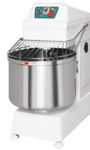
SM-50 Spiral Mixer Cap.: 54 Ltrs. Power: 2.2 Kw Max Kneading: 22 Kgs.