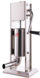
Sausage Stuffer, SV-7 Size: 300x300x795mm Cap.: 7 Ltrs.