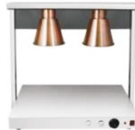
Double Lamp Warmer (with base heater) Size: 780x530x700mm Power: 1000w