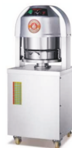
Dough Divider Size: 410x520x1240mm Power: 750W Dough Weight: 100~180gm