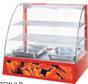
TFW-2 P Deluxe Food Warmer Size: 660x480x630mm Power: 800 W